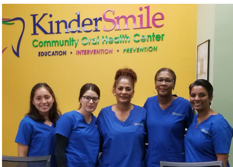
Click to meet the team.

Since opening two years ago, our "village" has grown immensely, and I am so proud to introduce all of the wonderful women in the article linked below.