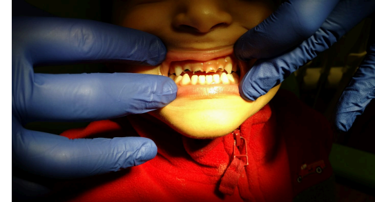
4 year old with baby bottle decay at a Montclair preschool.

These are the sort of topics covered in KinderSmile Perinatal Health & Wellness Program , the learning initiative which empowers pregnant and recently postpartum women with information about their babies' & their own oral health. Most importantly, it links them to a dental home where they can actually receive the dental care that their learning the importance of, regardless of their insurance or immigration status.