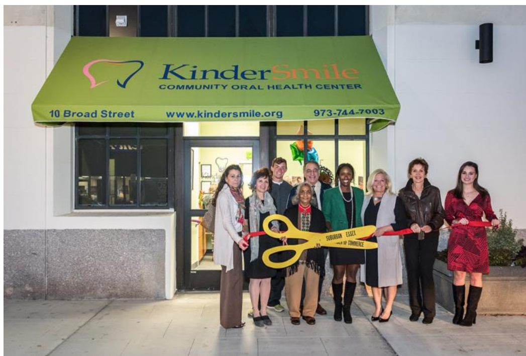
Suburban Essex Chamber of Commerce joins KSF Board members & staff to celebrate ribbon-cutting at 10 Broad Street site.

You are invited to tour our new Dental Home. For more information, call 973-744-7003 Ext. 209.